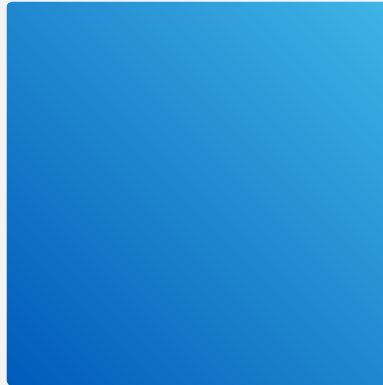
300C -> 298C